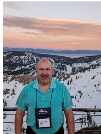
Right: Piccadilly Name Badge travelled to the Mountain Travel Symposium in Lake Tahoe. Julian F was there too!